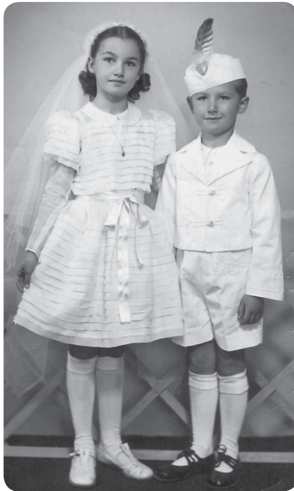
BEFORE THE SEIGE The Abbot and his sister dressed for their First Communion in May 1943.

My grandmother had cooked another, a bit more festive Christmas meal. We, the three children began to sleep on sofas and armchairs, while the soldiers continued to hit, force and hammer the