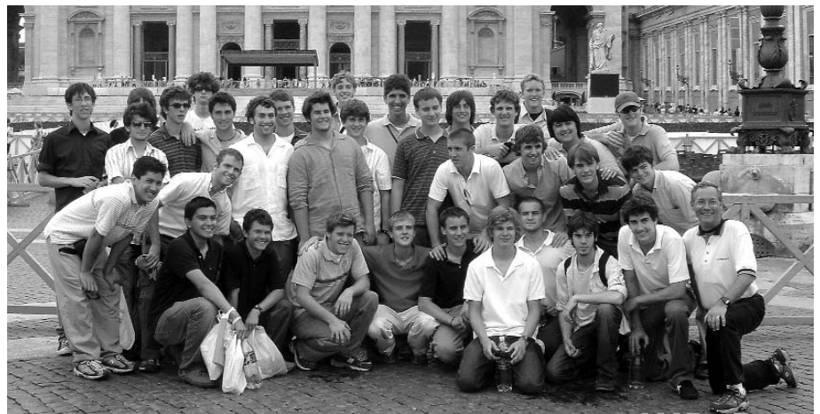
Members of the Class of 2006 pose in front of St. Peter's Basilica in Rome.