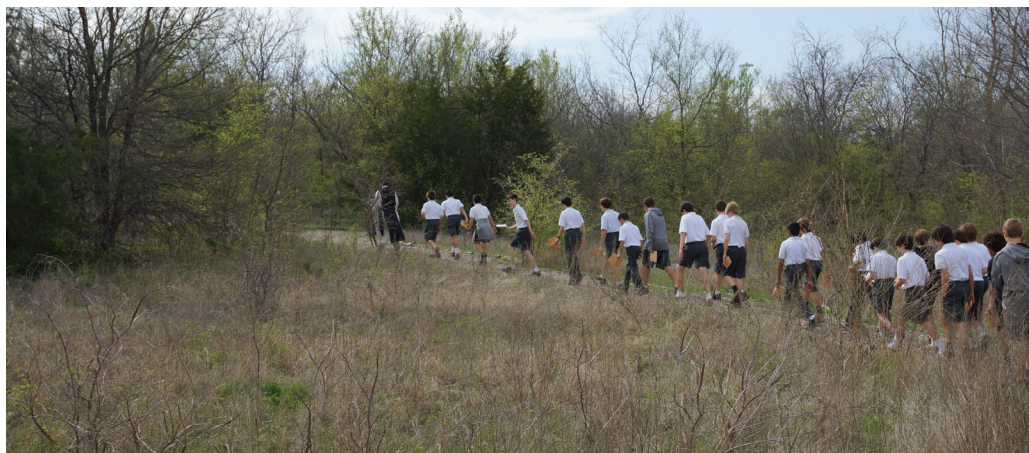
Cistercian Abbey Our Lady of Dallas 3550 Cistercian Road Irving, Texas 75039

The Collegium Cantorum will join us for Mass on the First Friday and third Sunday of each month during the school year.